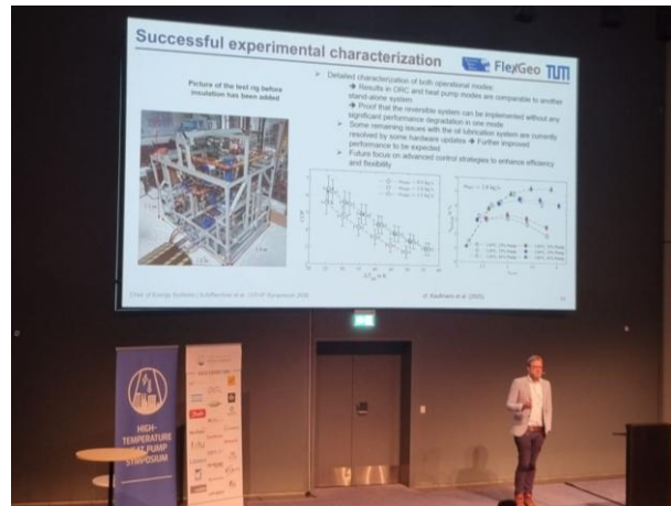
Project partners at the International Seminar on ORC Power Systems and project presentation at the High-Temperature Heat Pump Symposium